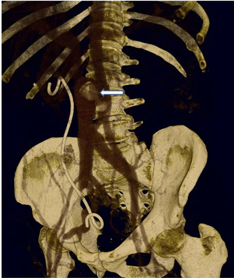
Figure 2 The CT scan at 1 month follow-up after vascular plug implantation showed recurrence of the aorto-caval communication. The Amplatzer vascular plug, still in correct position, was not able to halt the fistulous communication.

complete restoration of the functional capacity (from NYHA class III to NYHA class I) associated to a complete resolution of the lower extremities oedema. The patient also initiated a specific therapy for retroperitoneal fibrosis with steroids and tamoxifen. The CT scan performed one month later showed a complete abolishment of the shunt with no opacization of the inferior vena cava from the abdominal aorta (Figure 3). The Amplatzer vascular plug was excluded from the blood flow after the endoprosthesis implantation (Figure 3).