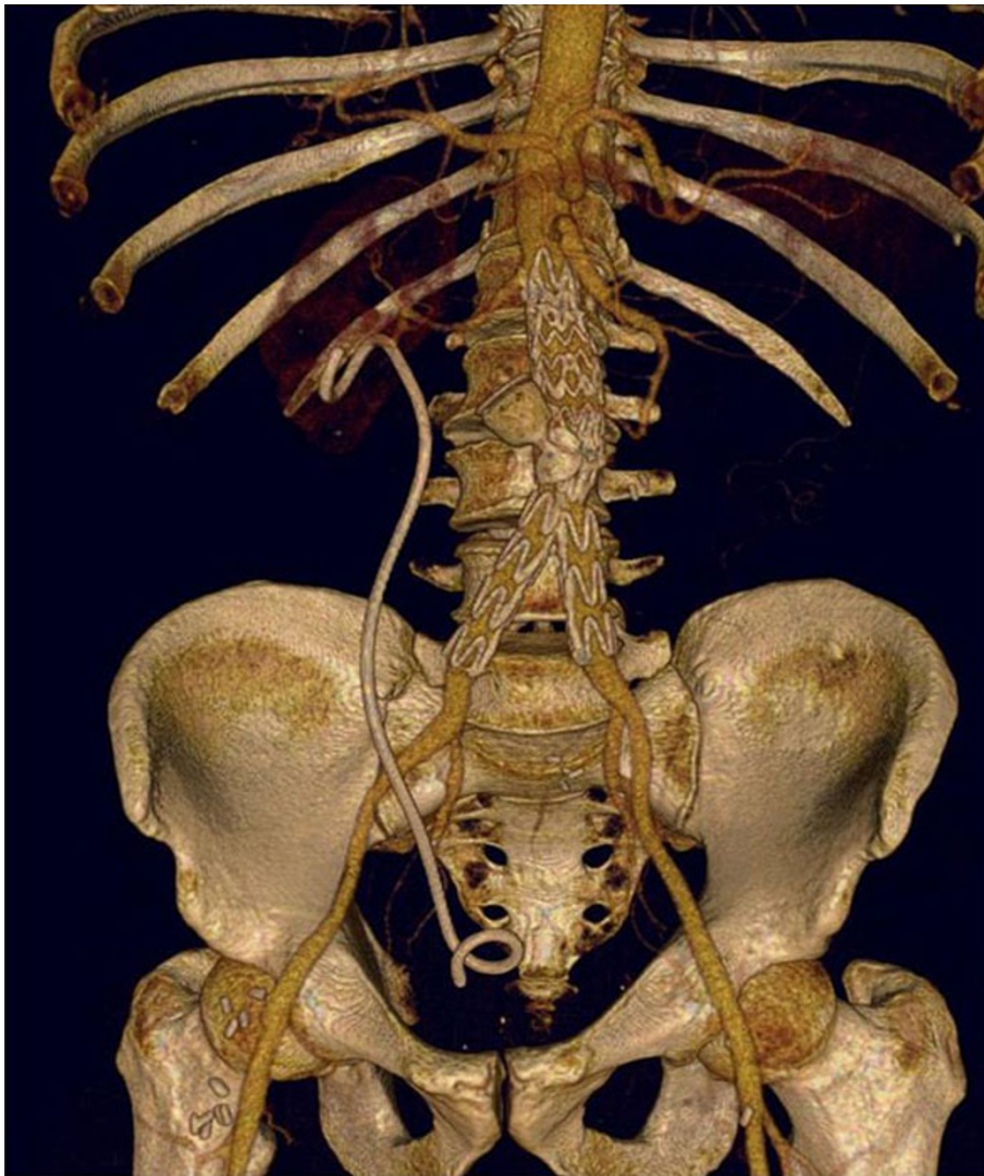
Figure 3 The CT scan 1 month after aortic endoprosthesis implantation showed a complete abolishment of the shunt with no opacization of the inferior vena cava from the abdominal aorta. The Amplatzer vascular plug was excluded from the aortic blood flow after the endoprosthesis implantation.

a patient that had developed a very hostile abdomen to be treated with an additional surgical approach. Since the fistulous shunt was causing very important and life threatening symptoms, we decided to percutaneously intervene before starting an appropriate medical therapy. In fact, any kind of intervention for IRPF does not reduce long term prognosis if not associated to specific pharmacological therapy.